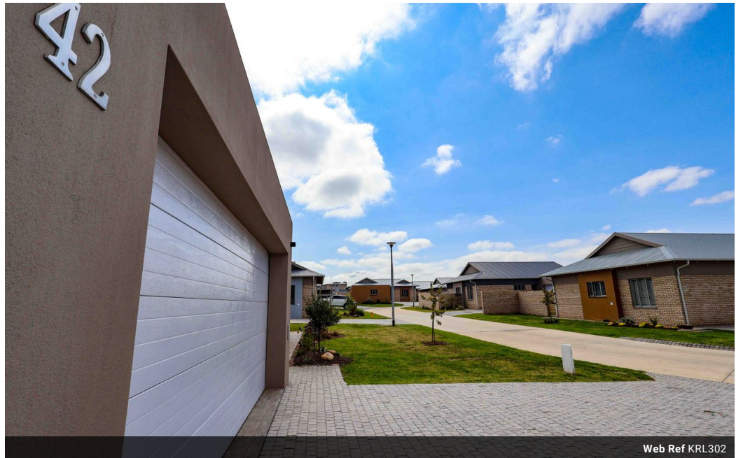
Web Ref KRL302

Regus Office Shamrock Building 2nd Floor 97 York Street George 6530