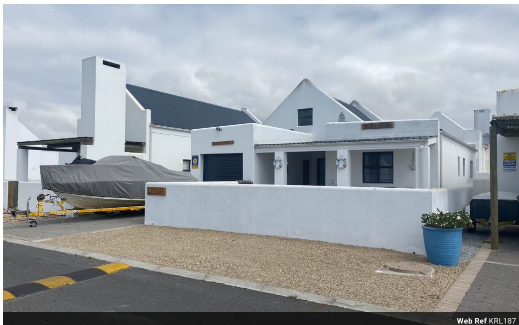
Web Ref KRL187

Regus Office Shamrock Building 2nd Floor 97 York Street George 6530