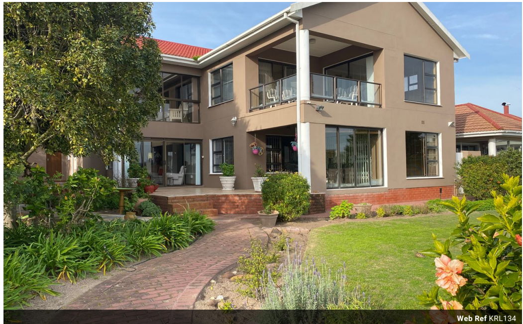
Web Ref KRL134

Regus Office Shamrock Building 2nd Floor 97 York Street George 6530